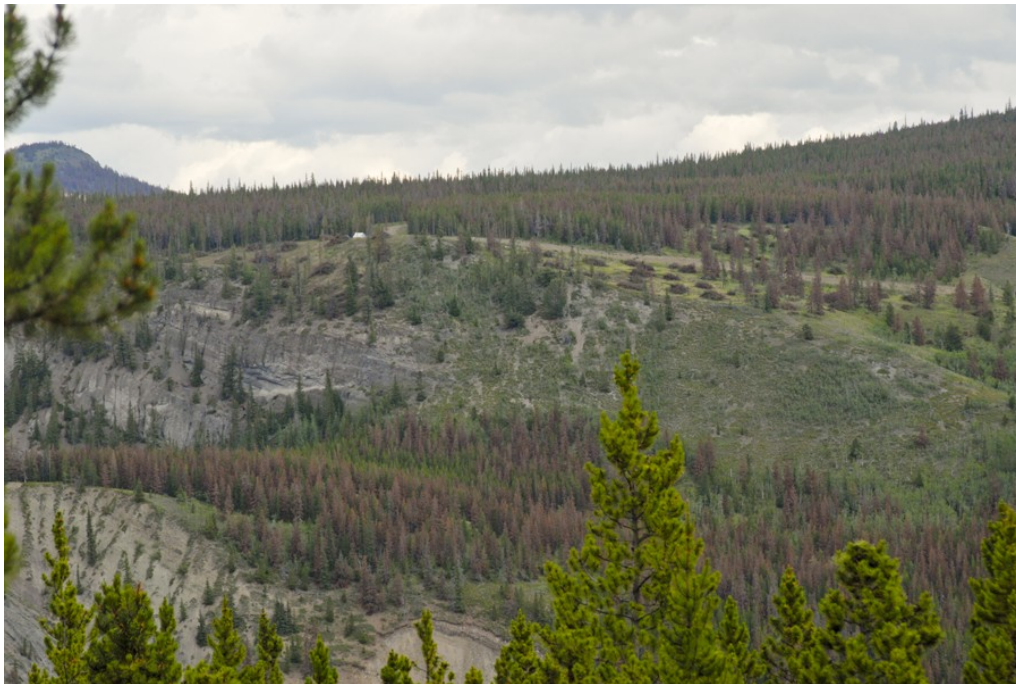
Figure 8: Overview of Treatment Unit 5 after work was completed in 2008.