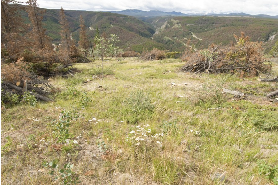
Figure 9: Overview of treatment unit 5 looking north towards the cliff band escape terrain.