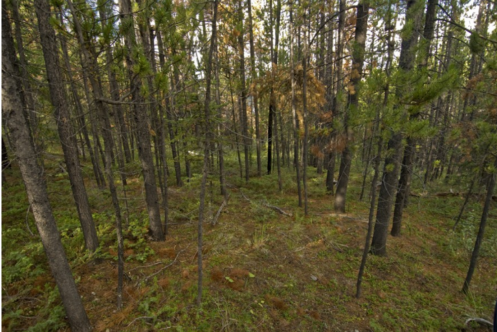
Figure 5. Site 2 before treatment in 2007.