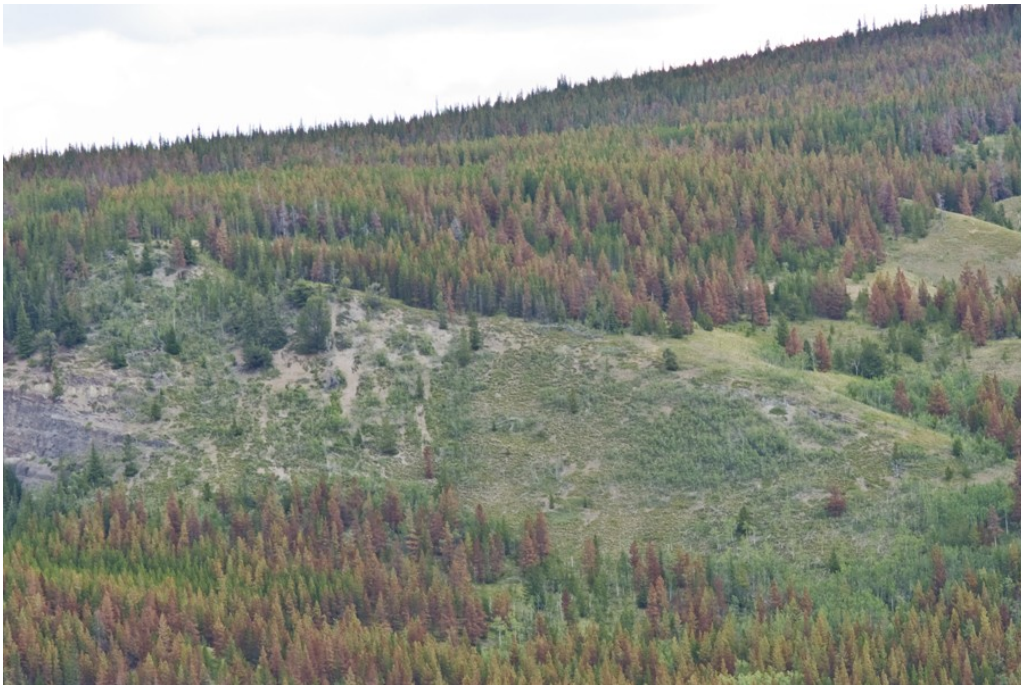
Figure 7: Overview of TU 5 in 2007 before work started.