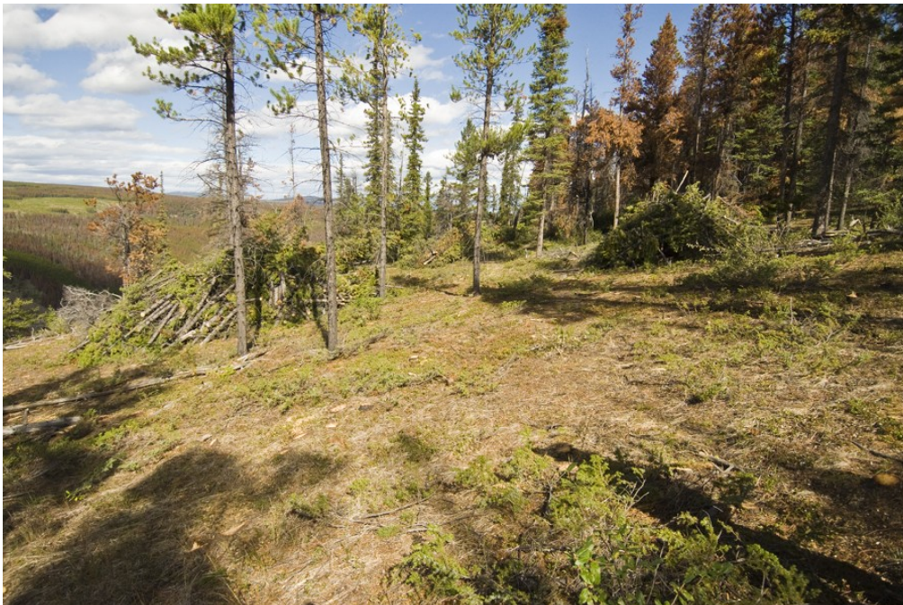
Figure 6. Site 2 after treatment in 2007.