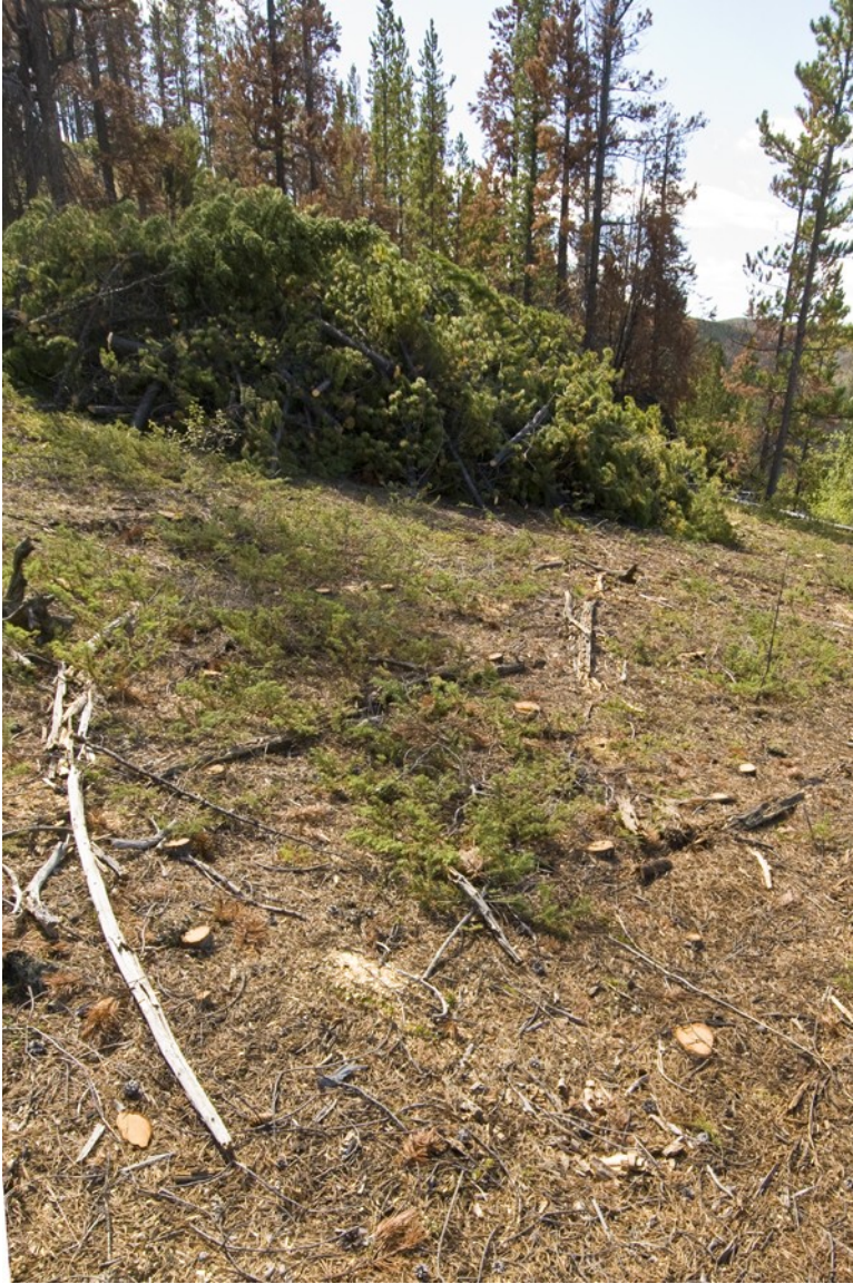
Figure 4. Site 1 after treatment in 2007.