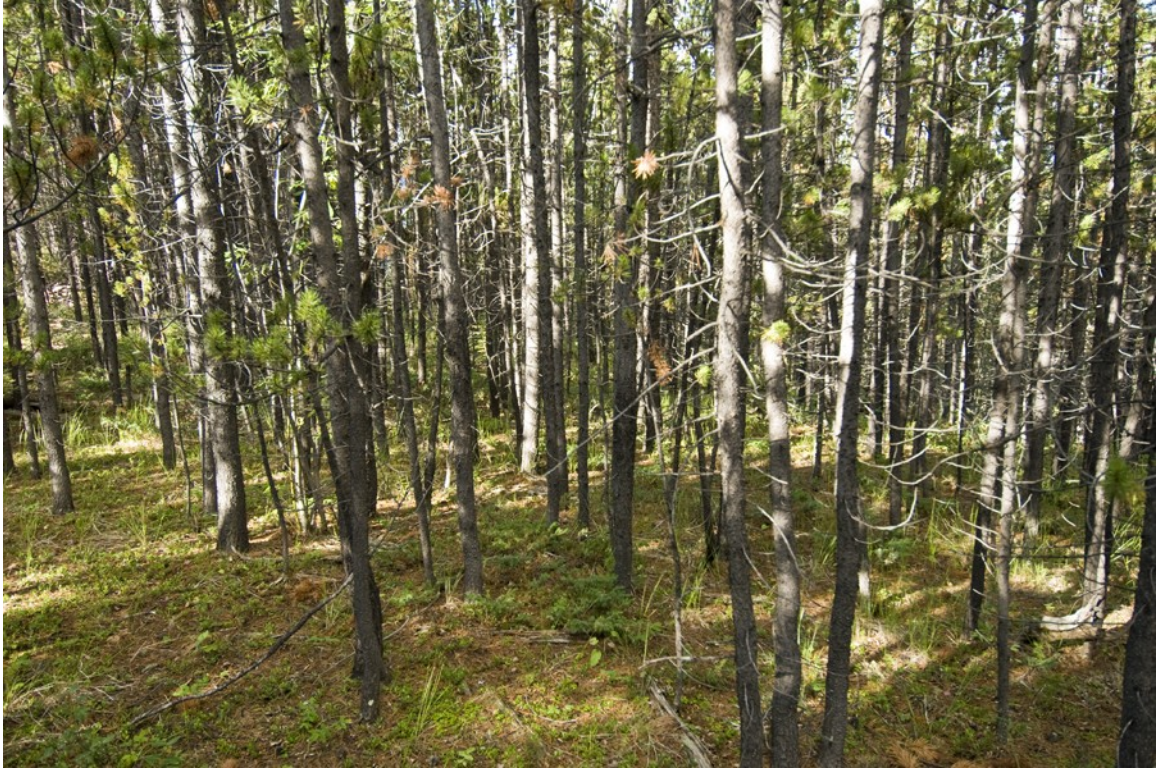
Figure 3. Site 1 before treatment in 2007.