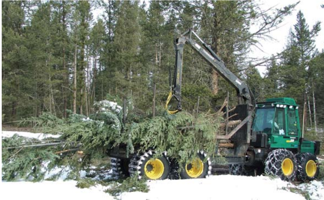
Figure 6: Forwarder transporting non-merchantable stems and debris to landing.

In the interim between the logging phase and the debris collection phase, significant snow melt