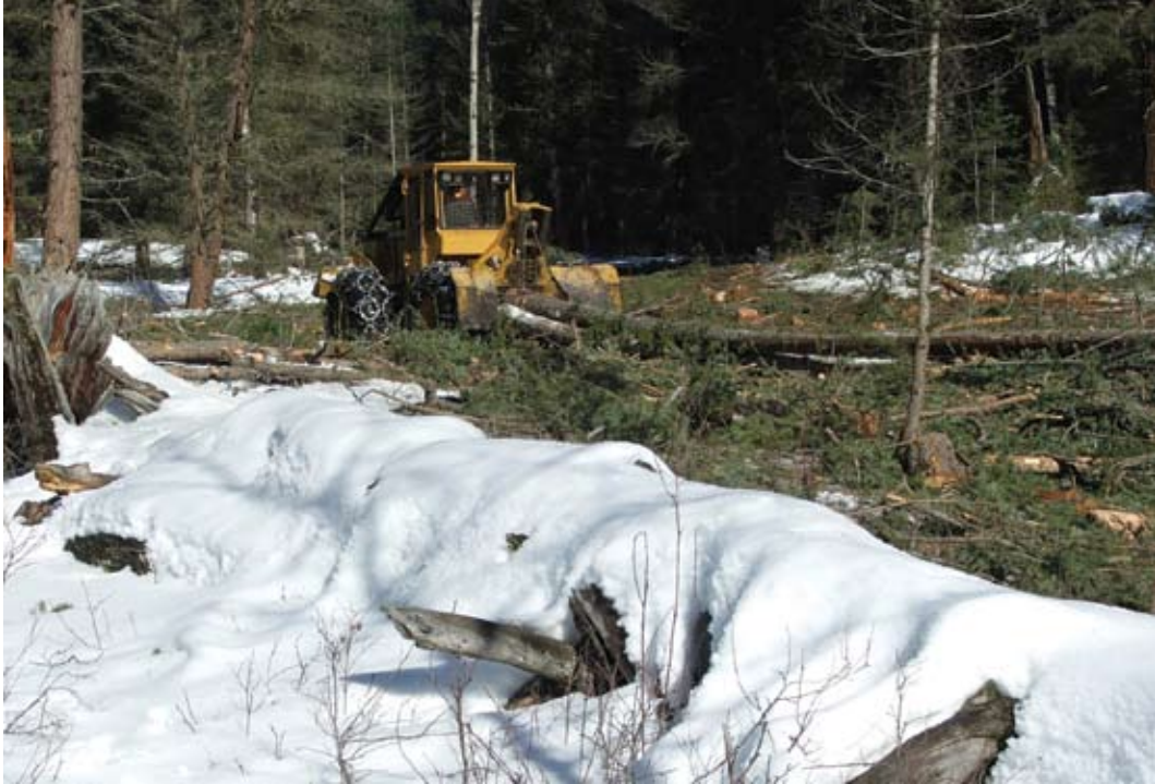
Figure 4: Line skidder avoiding existing coarse woody debris.