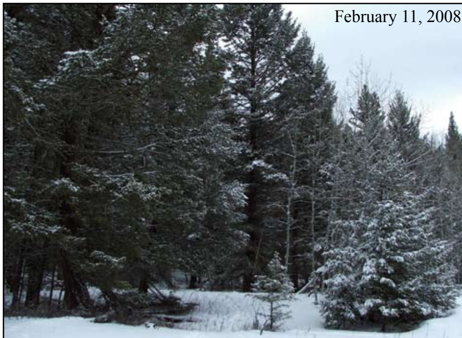
February 11, 2008

Ecosystem Restoration Team, Cariboo-Chilcotin Range Branch, Ministry of Forests and Range