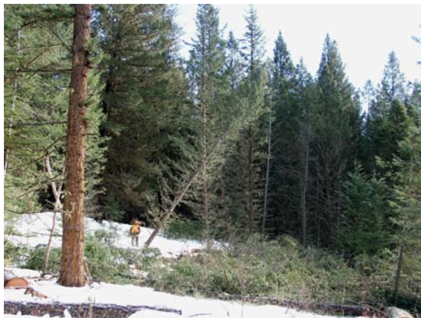
Figure 2: Day one of hand-falling, February, 13, 2008.

Conditions for logging were excellent; the ground was well frozen and there were 50 cm of snow in open areas. Temperatures remained below freezing throughout the logging phase. For the most part, falling and slashing were done simultaneously. This process was