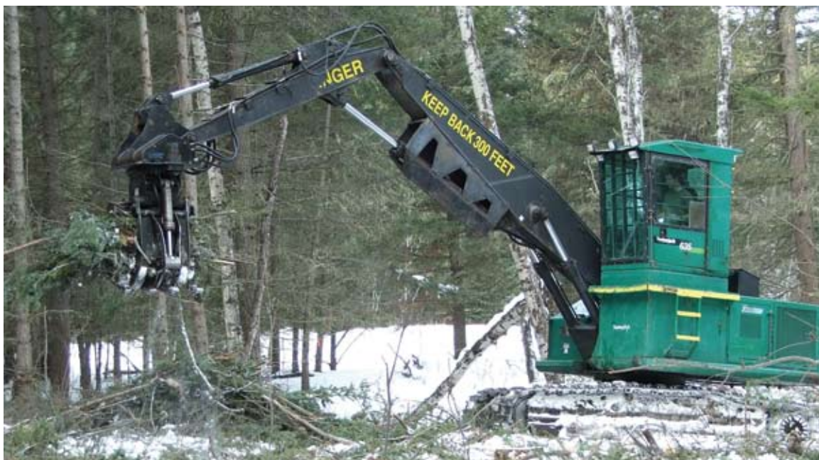
Figure 7: Loader with multi-pronged grapple “raking” and piling debris for forwarder to pick up.