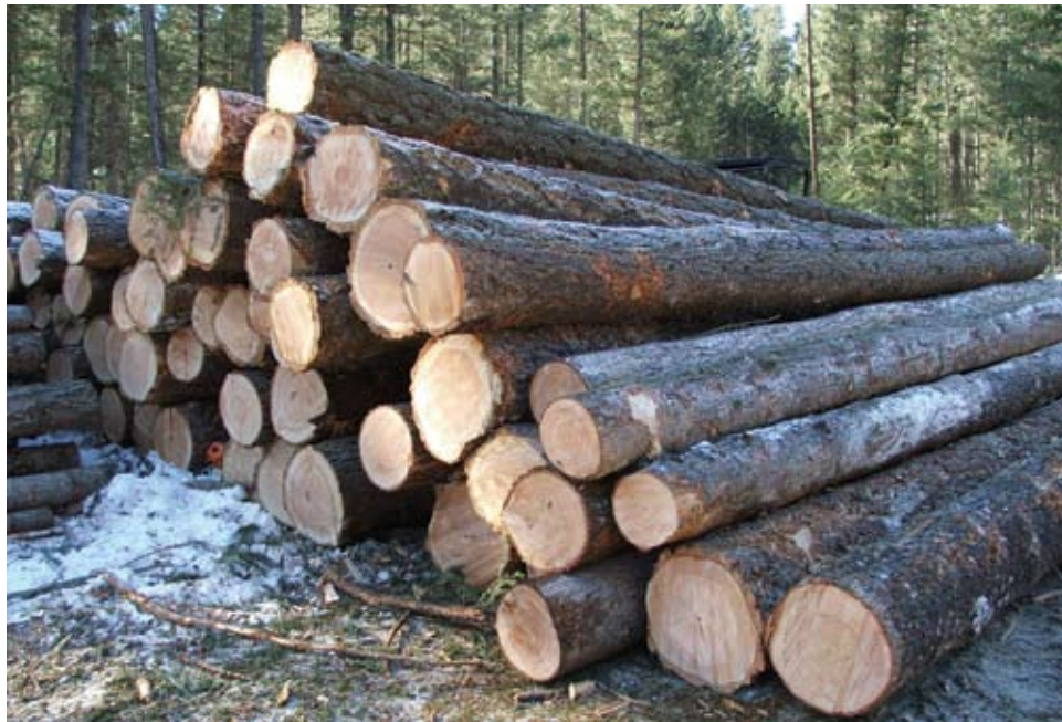
Figure 5: Douglas-fir sawlogs from removal of grassland encroachment.

the Research Forest and was available to bring a forwarder to the site to collect more debris (Fig. 6). On February 25, the owner-operator began collecting debris using the machine's grapple. It took from one to 1.5 hours to fill the bed and bring it to the landing. He decided to employ his log loader as well, as its grapple is more hand-like and could more quickly collect and pile debris that the forwarder could then pick up (Fig. 7). This decreased the forwarder cycle time to