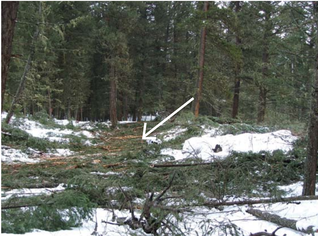
Figure 3: Skid trails armoured with slash with strategic pole placement in disturbance-prone sites (arrow).

recommended as being most efficient following a fuel reduction research project (Mitchell, 2007). The slash and debris effectively armoured the ground and allowed skidder access to most areas in a manner that spread out activity and prevented soil disturbance. The skidder operators also placed poles across disturbance-prone knoll crests to prevent surface scraping (Fig. 3). They kept an eye out for soil exposure and ceased skidding over those areas once observed. Most skid trails retained an ice base which further prevented disturbance. This crew did an excellent job of preventing logging-induced soil disturbance. As requested, they also refrained from skidding over existing coarse woody debris (Fig. 4).