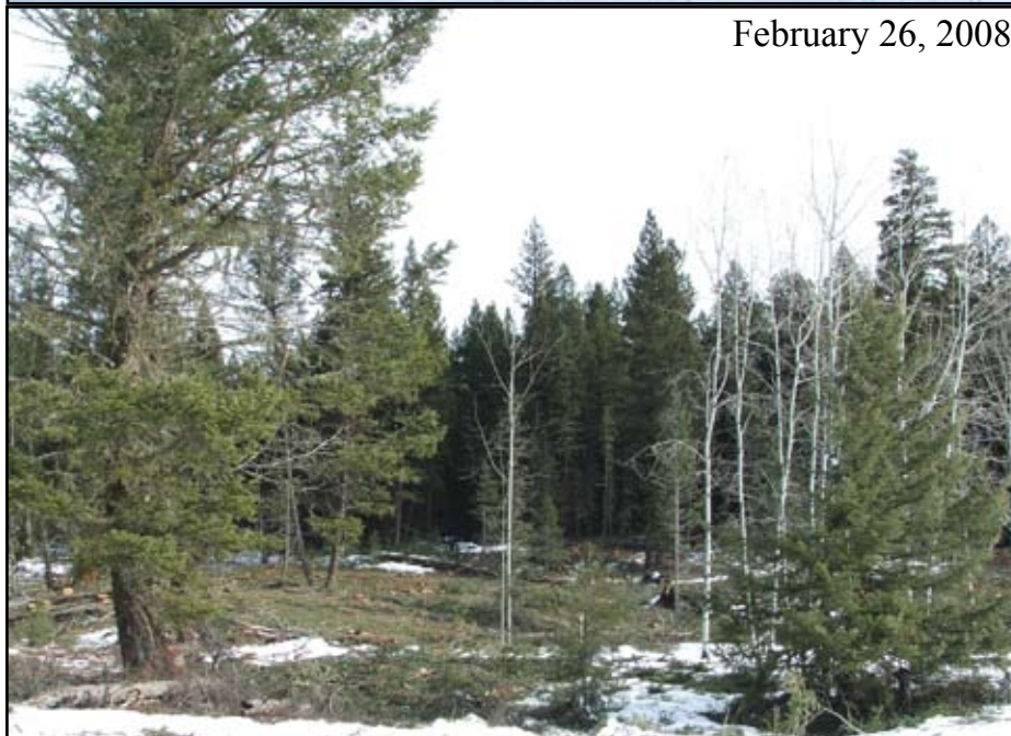
February 26, 2008